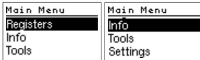
Figure 1: All items in Main Menu view

To access the main menu, press in the control toggle. The following screen will appear: