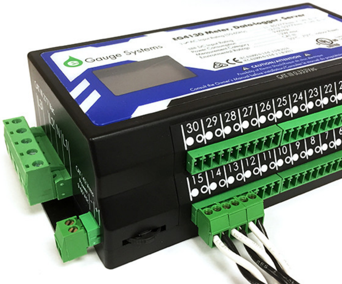
CTs connected to eGauge meter.