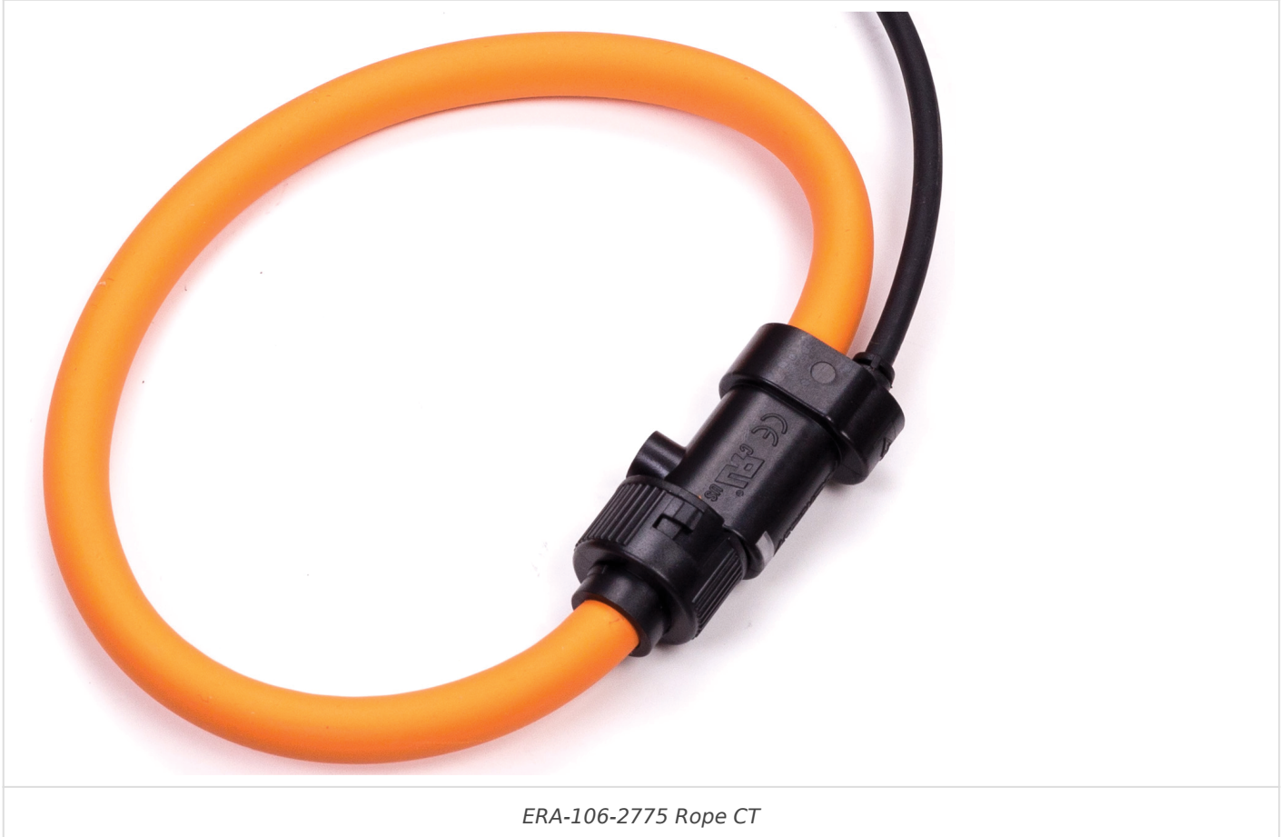
ERA-106-2775 Rope CT

Rope CTs are excellent for bus-bars and large switch-gear applications that standard split-core CTs cannot fit around. Rope CTs are flexible and easy to install but require a minimum amperage of approximately 30A for accuracy.